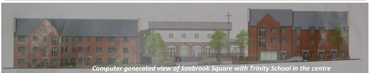
Computer generated view of Seabrook Square with Trinity School in the centre

Friends of Trinity School www.pta-events.co.uk/fots