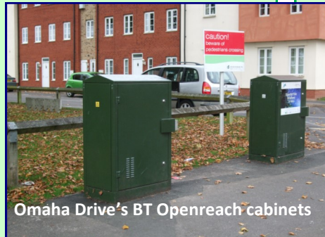
Omaha Drive's BT Openreach cabinets

In other words - BT and our Developers have let Newcourt down badly. There seems to have been no plan - or inadequate plans - before they started building; and still no clear plans for after they finish building.