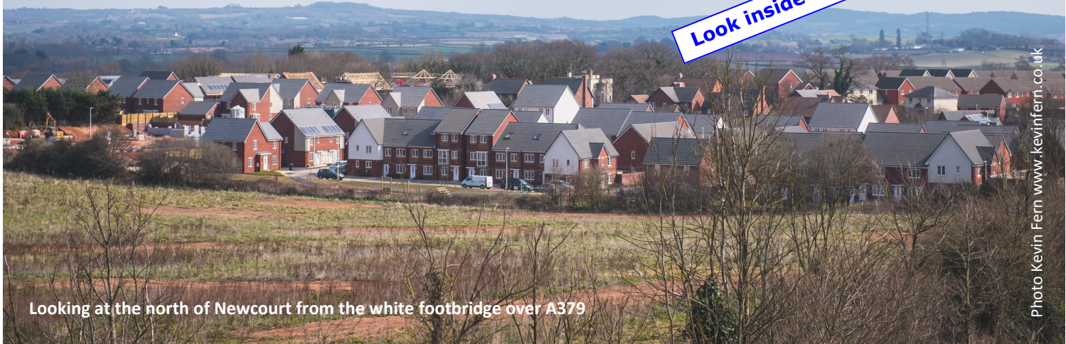
Looking at the north of Newcourt from the white footbridge over A379