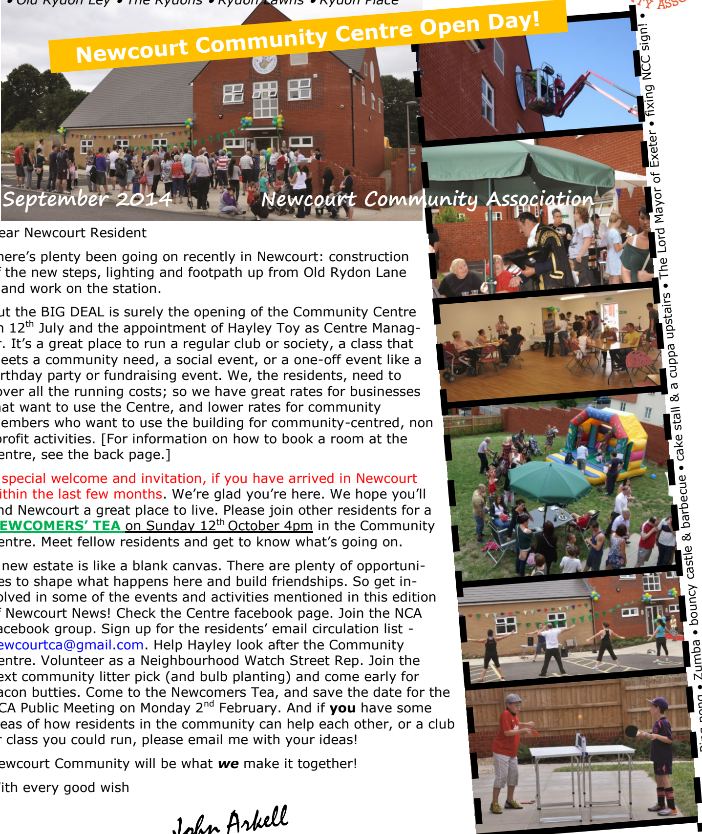
fixing NCC sign! • The Lord Mayor of Exeter • fixing NCC sign! • The Lord Mayor of Exeter • a cuppa upstairs • cake stall & a cuppa upstairs • cake stall & barbecue • bouncy castle & zumba • ping pong • zumba • ping pong